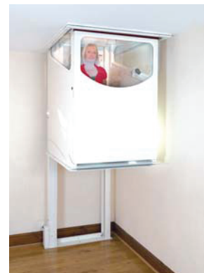
Lift approaching lower floor