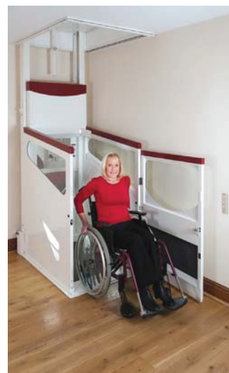
Harmony allows you to move between floors smoothly and safely. Can be used with or without your wheelchair. Fold-up seat available.

Operation is simple. Having called the lift from the easily accessible wireless wall control (with no unsightly plastic trunking), sited to suit the user, the car door can be opened by the same control. The low integral ramp allows easy wheelchair access and a push button inside the car closes the door. A push of the car control button (which can be positioned by the user to suit their needs - not available on the Compact model) will signal the car to travel to the other floor, automatically lifting or replacing the aperture ceiling panel en route, where the reverse procedure is followed to exit the car.