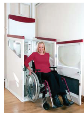
Exiting the lift downstairs