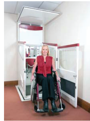
Entering the lift upstairs

Both lift-up aperture infill and car underpan are designed to provide a minimum half hour fire protection and both are fitted with smoke and intumescent fire seals. Pressure sensitive safety surface is incorporated in the floor aperture infill which will stop the lift if it is obstructed.