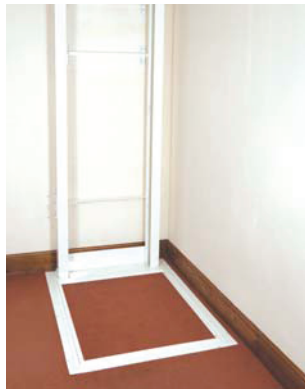
Upper room when lift downstairs