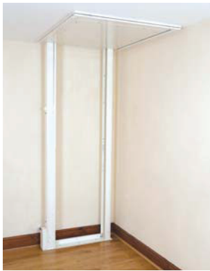
Lower room when lift upstairs