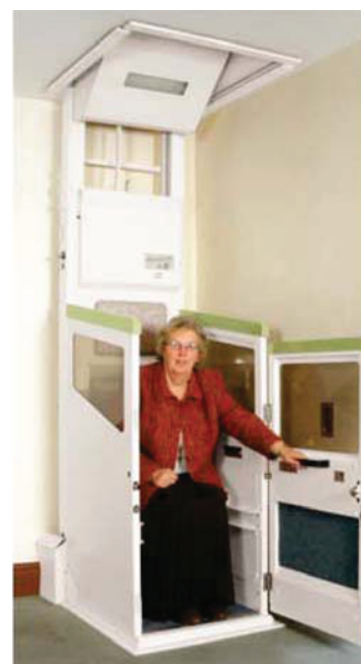
Harmony Compact at lower level with fixed seat.